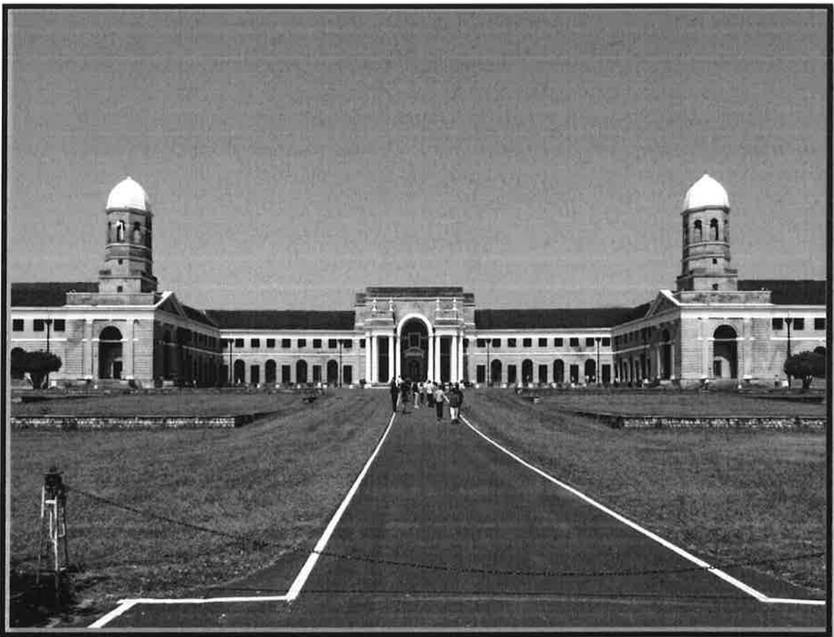
Forest research Institue, Dehradun